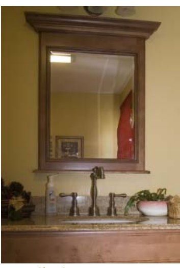
New Half Bath