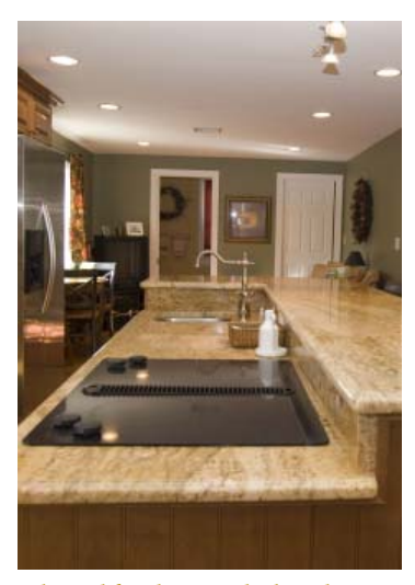
Relocated family room, bath and storage