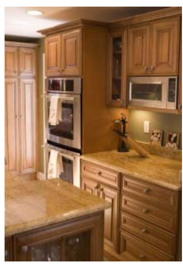
New cabinets and granite counters